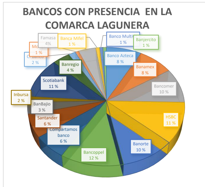
Figure 6. Bancos en la Comarca Lagunera